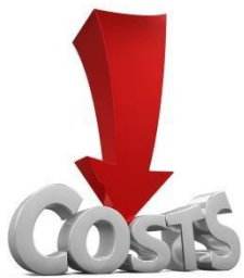
State Sales Tax Rates