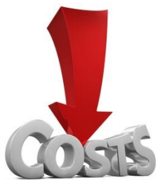
State Sales Tax Rates